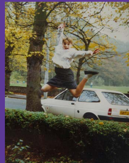
Jumping for joy